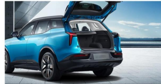
AUTOMATIC INDUCTION TAIL-GATE

Exquisite interior design, integrated interstellar sport seats, multicolor ambient lights. All luxury quality lies in details Multifunctional AC system, multi-effect strainer for negative ion purification. Each breath is pure and fresh Sound-absorbing materials in all positions create a quiet private space. Welcome light carpet makes each travel a ceremony Automatic induction tail-gate and contactless trunk open/shut for easy operation