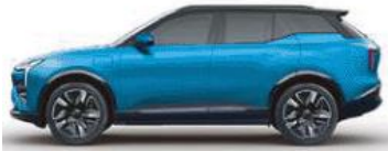
Aurora blue + Brilliant black