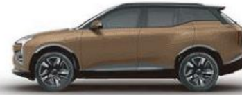
Dawn greyish gold+ Brilliant black