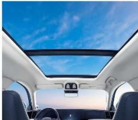
OPENABLE PANORAMIC SUNROOF