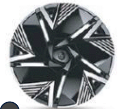
● 18in Tornado wheel rim