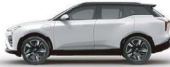
Moonshine white+ Brilliant black