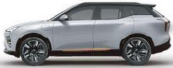
Space Gray + Brilliant black