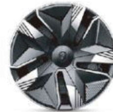
○ 21in Energetic blade wheel rim