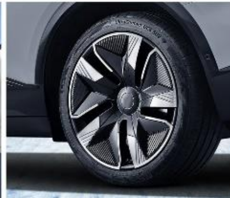
ENERGETIC BLADE WHEEL RIM