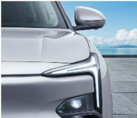
"EYE OF BLADE" HEADLIGHTS