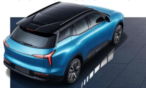
WELCOME LIGHT CARPET